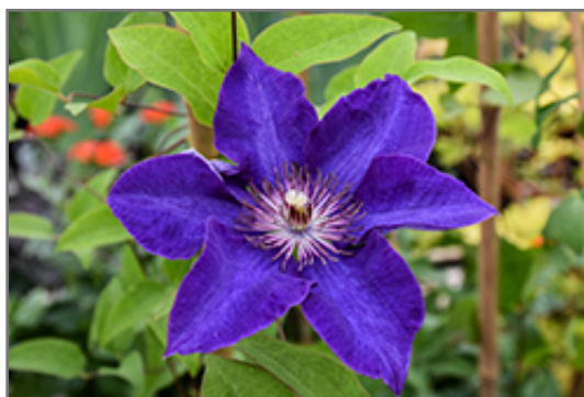
The President Clematis flowers