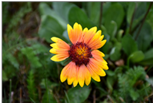
Blanket Flower flowers