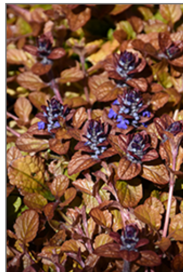
Feathered Friends Parrot Paradise Bugleweed flowers

Feathered Friends Parrot Paradise Bugleweed is a fine choice for the garden, but it is also a good selection for planting in outdoor pots and containers. Because of its spreading habit of growth, it is ideally suited for use as a 'spiller' in the 'spiller-thriller-filler' container combination; plant it near the edges where it can spill gracefully over the pot. Note that when growing plants in outdoor containers and baskets, they may require more frequent waterings than they would in the yard or garden. Be aware that in our climate, most plants cannot be expected to survive the winter if left in containers outdoors, and this plant is no exception. Contact our experts for more information on how to protect it over the winter months.