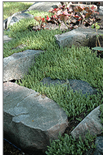
Six Row Stonecrop