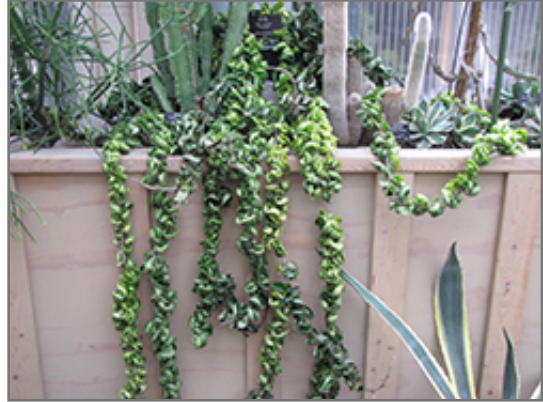
Hindu Rope Plant

When grown indoors, Hindu Rope Plant can be expected to grow to be about 12 inches tall at maturity, with a spread of 3 feet. It grows at a medium rate, and under ideal conditions can be expected to live for approximately 10 years. This houseplant should be situated in a location that gets indirect sunlight at most, although it will usually require a more brightly-lit environment than what artificial indoor lighting alone can provide. It is very adaptable to both dry and moist soil, but will not tolerate any standing water. The surface of the soil shouldn't be allowed to dry out completely, and so you should expect to water this plant once and possibly even twice each week. Be aware that your particular watering schedule may vary depending on its location in the room, the pot size, plant size and other conditions; if in doubt, ask one of our experts in the store for advice. It is particular about its soil conditions, with a strong preference for rich, acidic soil. Contact the store for specific recommendations on pre-mixed potting soil for this plant.