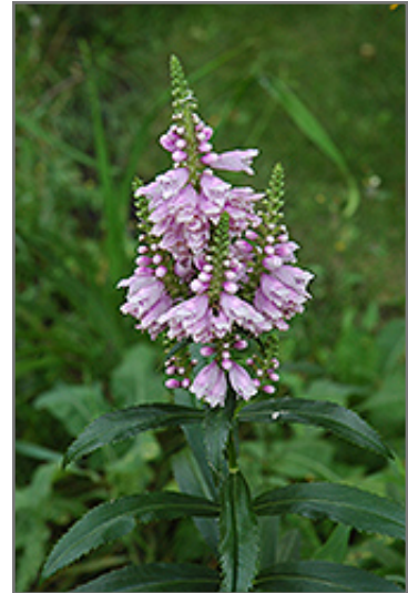
Obedient Plant flowers

This plant does best in full sun to partial shade. It is very adaptable to both dry and moist locations, and should do just fine under typical garden conditions. It is not particular as to soil type or pH. It is highly tolerant of urban pollution and will even thrive in inner city environments. This species is native to parts of North America. It can be propagated by division.