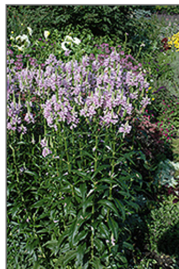
Obedient Plant in bloom