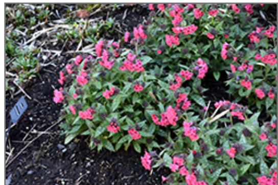
Shrimps On The Barbie Lungwort in bloom