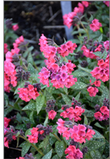
Shrimps On The Barbie Lungwort flowers

Shrimps On The Barbie Lungwort is recommended for the following landscape applications;