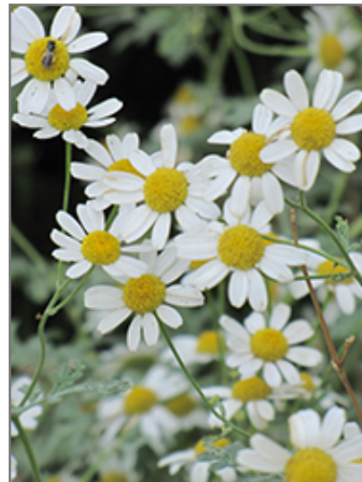
German Chamomile flowers