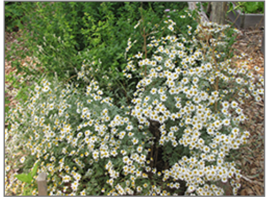
German Chamomile

This plant is quite ornamental as well as edible, and is as much at home in a landscape or flower garden as it is in a designated herb garden. It does best in full sun to partial shade. It is very adaptable to both dry and moist locations, and should do just fine under typical garden conditions. It is not particular as to soil type or pH. It is somewhat tolerant of urban pollution. This species is not originally from North America.