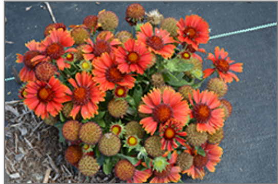
Spintop Yellow Touch Blanket Flower in bloom

Spintop Yellow Touch Blanket Flower will grow to be about 12 inches tall at maturity, with a spread of 14 inches. When grown in masses or used as a bedding plant, individual plants should be spaced approximately 12 inches apart. Its foliage tends to remain dense right to the ground, not requiring facer plants in front. It grows at a fast rate, and under ideal conditions can be expected to live for approximately 5 years. As an herbaceous perennial, this plant will usually die back to the crown each winter, and will regrow from the base each spring. Be careful not to disturb the crown in late winter when it may not be readily seen!