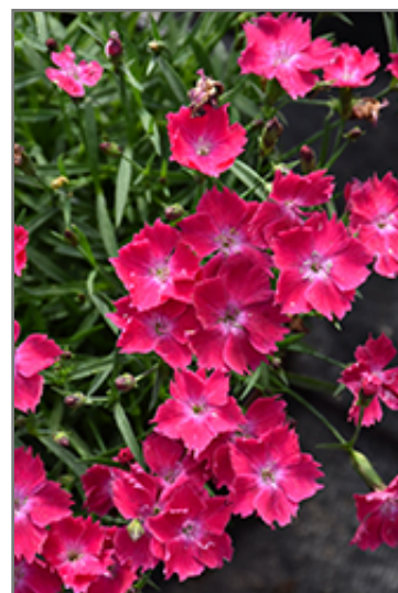
Beauties Kahori Scarlet Pinks flowers

Beauties Kahori Scarlet Pinks is recommended for the following landscape applications;