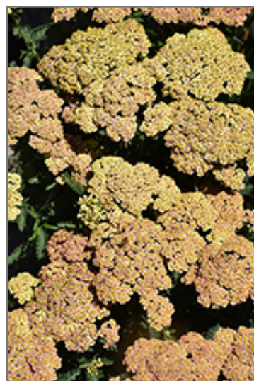
Firefly Peach Sky Yarrow flowers

Firefly Peach Sky Yarrow is recommended for the following landscape applications;