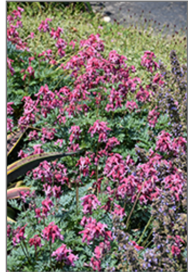
Pink Diamonds Fern-leaved Bleeding Heart flowers

This plant will require occasional maintenance and upkeep, and should be cut back in late fall in preparation for winter. It is a good choice for attracting butterflies to your yard, but is not particularly attractive to deer who tend to leave it alone in favor of tastier treats. It has no significant negative characteristics.