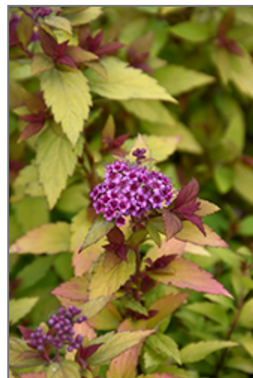
Poprocks Rainbow Fizz Spirea flowers