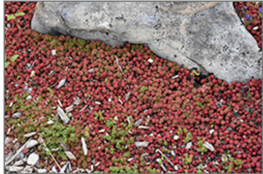
Coral Carpet Stonecrop

This is a relatively low maintenance plant, and is best cleaned up in early spring before it resumes active growth for the season. It is a good choice for attracting bees and butterflies to your yard, but is not particularly attractive to deer who tend to leave it alone in favor of tastier treats. It has no significant negative characteristics.