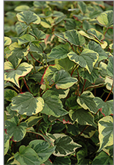
Variegated Chameleon Plant foliage