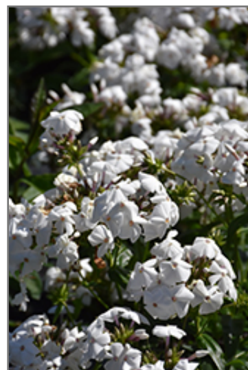
Opening Act White Phlox flowers

Opening Act White Phlox is recommended for the following landscape applications;