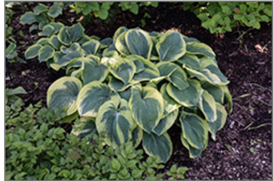
Northern Exposure Hosta

Northern Exposure Hosta is recommended for the following landscape applications;