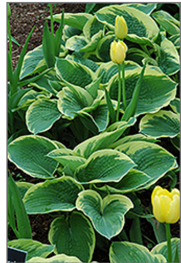
Northern Exposure Hosta