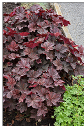
Palace Purple Coral Bells

Palace Purple Coral Bells is recommended for the following landscape applications;