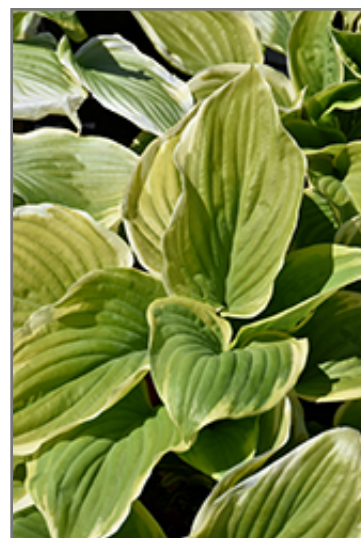
Fragrant Dream Hosta foliage