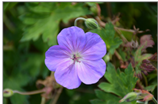
Rozanne Cranesbill flowers