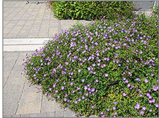
Rozanne Cranesbill in bloom

Rozanne Cranesbill is recommended for the following landscape applications;