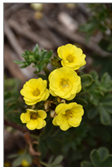
Citrus Tart Potentilla flowers