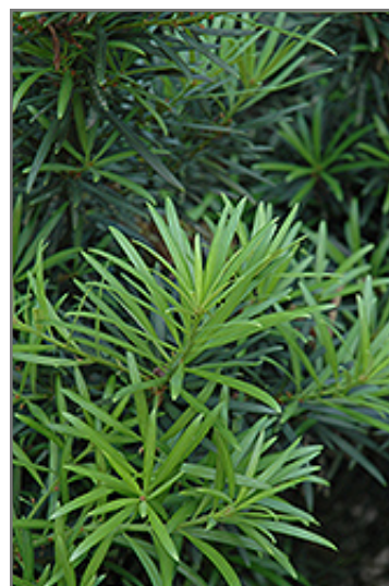
Japanese Yew foliage

When grown indoors, Japanese Yew can be expected to grow to be about 6 feet tall at maturity, with a spread of 3 feet. It grows at a slow rate, and under ideal conditions can be expected to live for approximately 50 years. This houseplant will do well in a location that gets either direct or indirect sunlight, although it will usually require a more brightly-lit environment than what artificial indoor lighting alone can provide. It does best in average to evenly moist soil, but will not tolerate standing water. The surface of the soil shouldn't be allowed to dry out completely, and so you should expect to water this plant once and possibly even twice each week. Be aware that your particular watering schedule may vary depending on its location in the room, the pot size, plant size and other conditions; if in doubt, ask one of our experts in the store for advice. It is not particular as to soil type or pH; an average potting soil should work just fine.