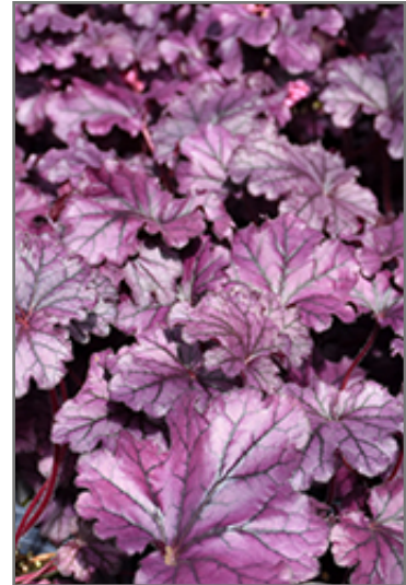
Forever Purple Coral Bells foliage