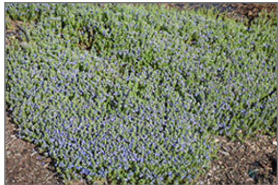
Tidal Pool Speedwell in bloom