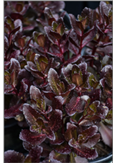
Touchdown Teak Stonecrop foliage

Touchdown Teak Stonecrop is a fine choice for the garden, but it is also a good selection for planting in outdoor pots and containers. With its upright habit of growth, it is best suited for use as a 'thriller' in the 'spiller-thriller-filler' container combination; plant it near the center of the pot, surrounded by smaller plants and those that spill over the edges. Note that when growing plants in outdoor containers and baskets, they may require more frequent waterings than they would in the yard or garden. Be aware that in our climate, most plants cannot be expected to survive the winter if left in containers outdoors, and this plant is no exception. Contact our experts for more information on how to protect it over the winter months.