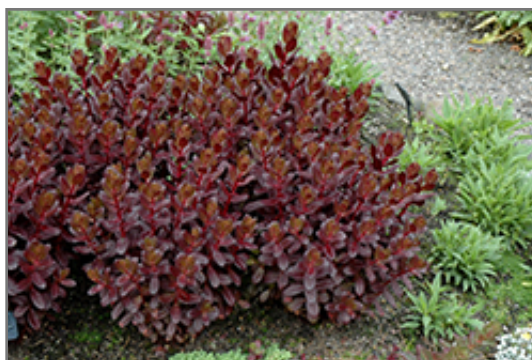
Touchdown Teak Stonecrop

Touchdown Teak Stonecrop is a dense herbaceous perennial with an upright spreading habit of growth. Its medium texture blends into the garden, but can always be balanced by a couple of finer or coarser plants for an effective composition.