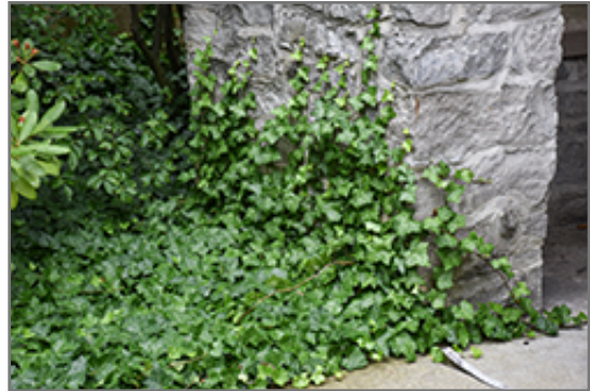
English Ivy

English Ivy makes a fine choice for the outdoor landscape, but it is also well-suited for use in outdoor pots and containers. Because of its spreading habit of growth, it is ideally suited for use as a 'spiller' in the 'spiller-thriller-filler' container combination; plant it near the edges where it can spill gracefully over the pot. Note that when grown in a container, it may not perform exactly as indicated on the tag - this is to be expected. Also note that when growing plants in outdoor containers and baskets, they may require more frequent waterings than they would in the yard or garden. Be aware that in our climate, most plants cannot be expected to survive the winter if left in containers outdoors, and this plant is no exception. Contact our experts for more information on how to protect it over the winter months.