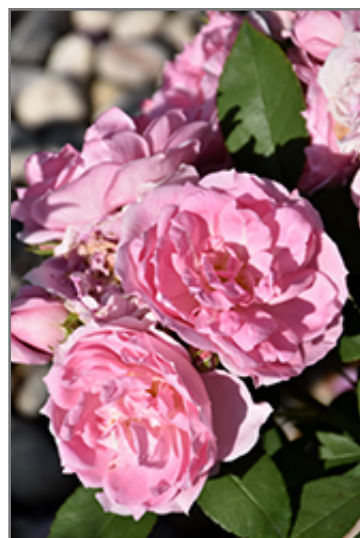
Prairie Joy Rose flowers