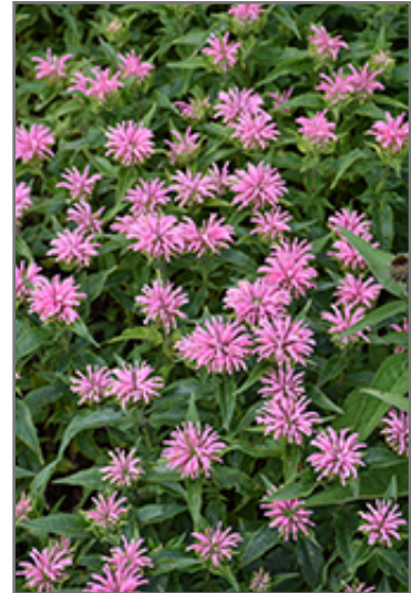
Pardon My Pink Beebalm flowers