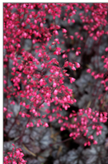
Glitter Coral Bells flowers

Glitter Coral Bells will grow to be about 10 inches tall at maturity extending to 16 inches tall with the flowers, with a spread of 14 inches. When grown in masses or used as a bedding plant, individual plants should be spaced approximately 12 inches apart. Its foliage tends to remain low and dense right to the ground. It grows at a medium rate, and under ideal conditions can be expected to live for approximately 10 years. As an evergreen perennial, this plant will typically keep its form and foliage year-round.