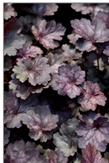
Glitter Coral Bells foliage