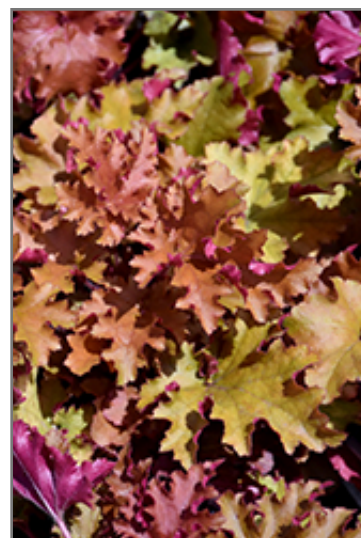
Zipper Coral Bells foliage