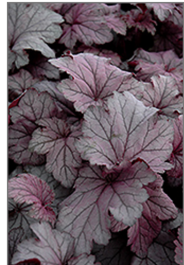
Spellbound Coral Bells foliage