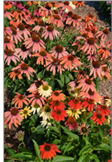
Cheyenne Spirit Coneflower in bloom

Cheyenne Spirit Coneflower is recommended for the following landscape applications;