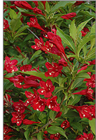
Red Prince Weigela flowers