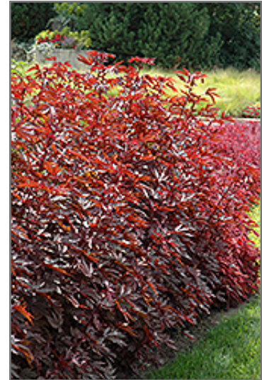
Mahogany Splendor Hibiscus

Mahogany Splendor Hibiscus is recommended for the following landscape applications;