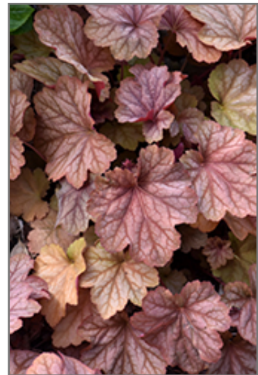
Carnival Watermelon Coral Bells foliage