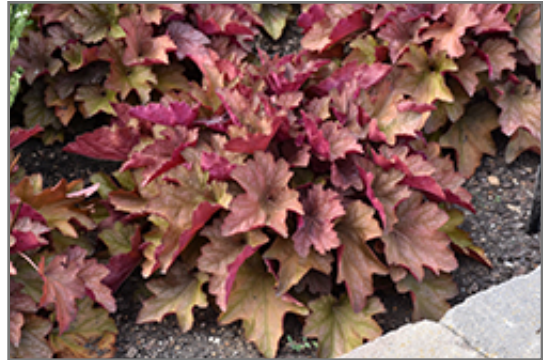
Carnival Watermelon Coral Bells

Carnival Watermelon Coral Bells is recommended for the following landscape applications;