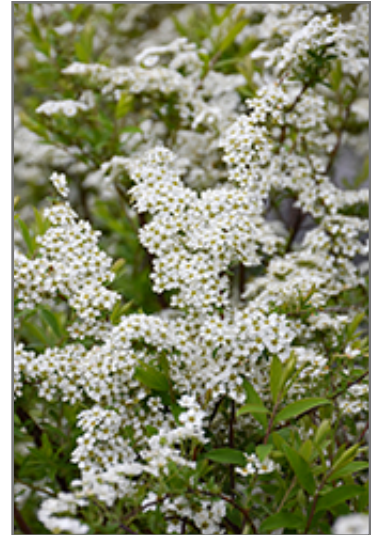
Dwarf Garland Spirea flowers

Dwarf Garland Spirea will grow to be about 4 feet tall at maturity, with a spread of 3 feet. It tends to fill out right to the ground and therefore doesn't necessarily require facer plants in front. It grows at a fast rate, and under ideal conditions can be expected to live for approximately 20 years.