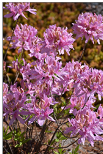
Orchid Lights Azalea flowers

This shrub does best in full sun to partial shade. You may want to keep it away from hot, dry locations that receive direct afternoon sun or which get reflected sunlight, such as against the south side of a white wall. It requires an evenly moist well-drained soil for optimal growth, but will die in standing water. It is very fussy about its soil conditions and must have rich, acidic soils to ensure success, and is subject to chlorosis (yellowing) of the foliage in alkaline soils. It is somewhat tolerant of urban pollution, and will benefit from being planted in a relatively sheltered location. Consider applying a thick mulch around the root zone in winter to protect it in exposed locations or colder microclimates. This particular variety is an interspecific hybrid.