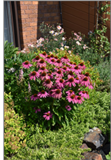
PowWow Wild Berry Coneflower in bloom