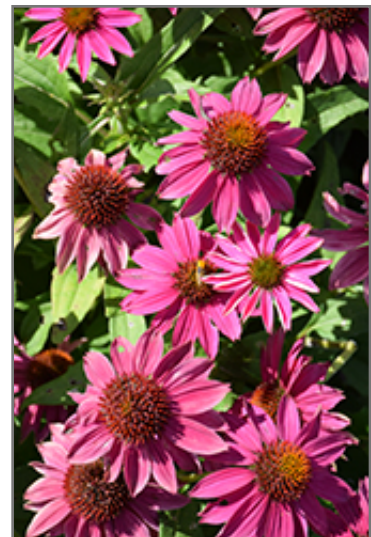
PowWow Wild Berry Coneflower flowers