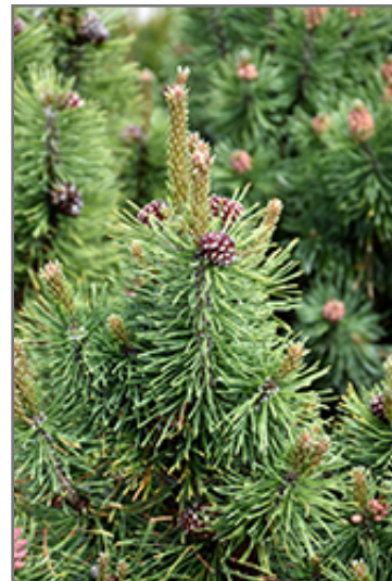
Big Tuna Mugo Pine foliage