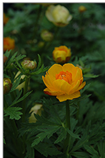
Orange Crest Globeflower flowers

A strikingly beautiful perennial with eye catching orange-yellow blooms in late spring; likes even moisture, consider adding a summer mulch around the base