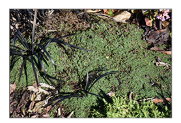
Elfin Creeping Thyme

Elfin Creeping Thyme is recommended for the following landscape applications;