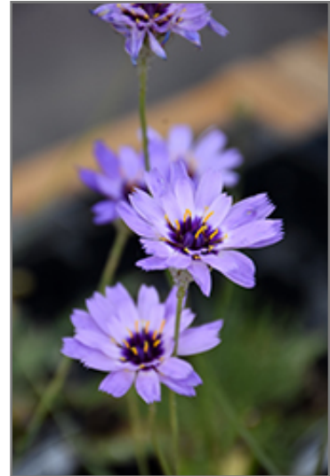
Cupid's Dart flowers