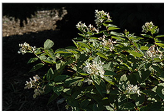
Compact Pee Gee Hydrangea flowers