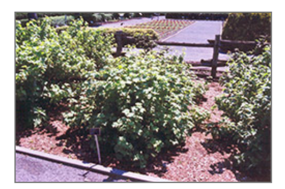
Red Lake Red Currant