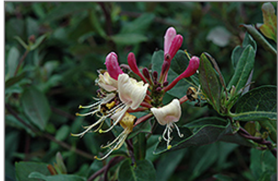
Honeybush Honeysuckle flowers

Honeybush Honeysuckle will grow to be about 24 inches tall at maturity, with a spread of 4 feet. It tends to fill out right to the ground and therefore doesn't necessarily require facer plants in front. It grows at a medium rate, and under ideal conditions can be expected to live for approximately 20 years.