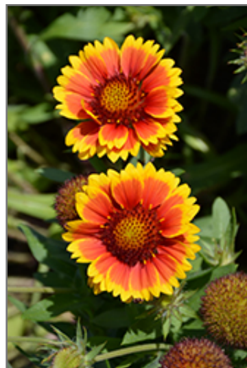
Arizona Sun Blanket Flower flowers

Arizona Sun Blanket Flower is recommended for the following landscape applications;