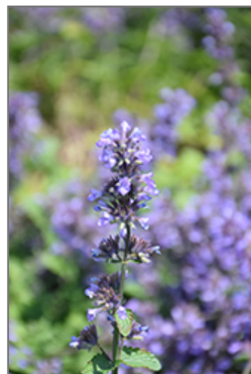
Cat's Pajamas Catmint flowers