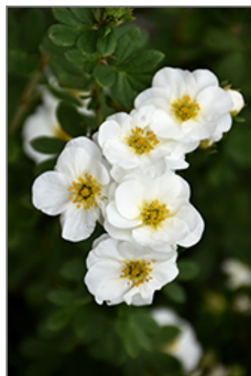
Creme Brulee Potentilla flowers

Creme Brulee Potentilla will grow to be about 3 feet tall at maturity, with a spread of 3 feet. It tends to fill out right to the ground and therefore doesn't necessarily require facer plants in front. It grows at a slow rate, and under ideal conditions can be expected to live for approximately 30 years.