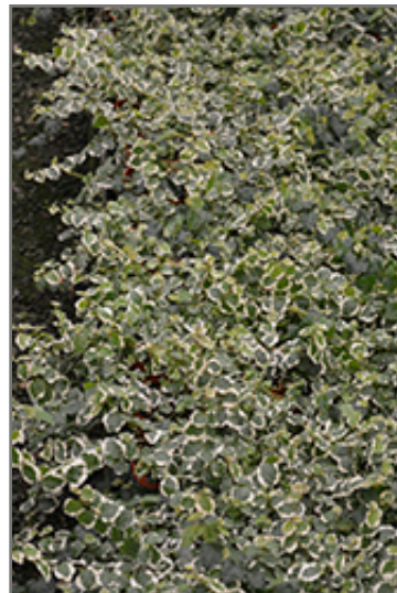
Variegated Creeping Fig in full