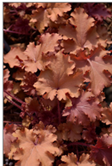
Peach Crisp Coral Bells foliage

Peach Crisp Coral Bells will grow to be about 14 inches tall at maturity extending to 20 inches tall with the flowers, with a spread of 18 inches. When grown in masses or used as a bedding plant, individual plants should be spaced approximately 15 inches apart. Its foliage tends to remain dense right to the ground, not requiring facer plants in front. It grows at a medium rate, and under ideal conditions can be expected to live for approximately 10 years. As an evergreen perennial, this plant will typically keep its form and foliage year-round.